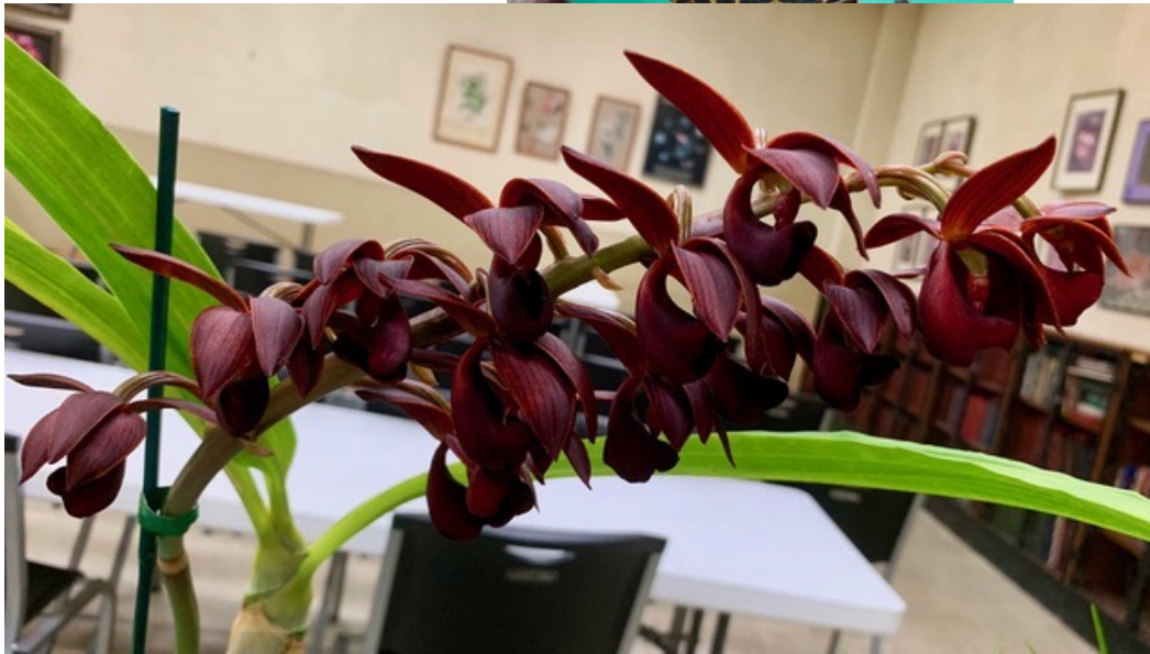
Morm. Midnight Hooker HCC/AOS

2018-19 CSA San Marino Judging Center Schedule Judging Cymbidiums, Paphiopedilums, Phragmipediums Huntington Botanical Gardens Mishler Resource Building 1151 Oxford Road, San Marino, CA 91108 12:30pm Registration 1:00pm Judging Next sessions are: February 9, March 9, April 13, May 11, Summer Break, Aug 10, Sept. 14, Oct 12, Nov. 9, Dec 14