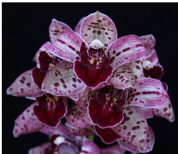
Cym. Lotza Spetz 'Nancy'