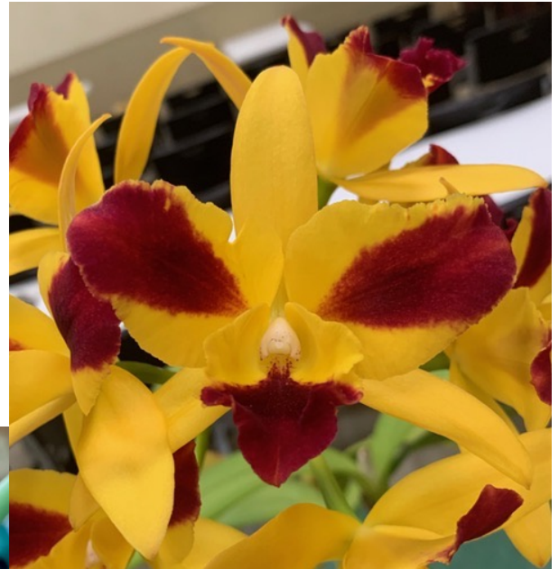
Ctt. Tropical Splash 'SVO' HCC/AOS